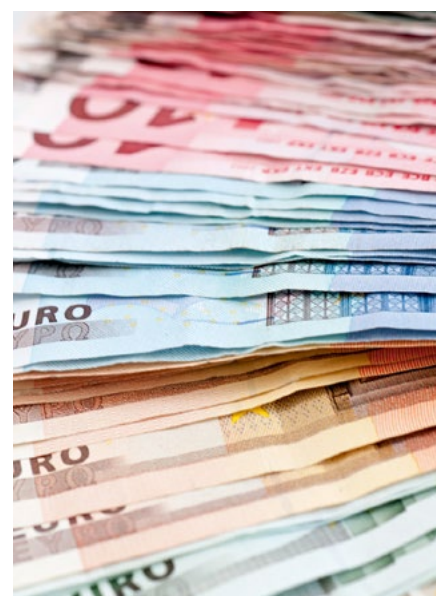
The fact that surveys incur costs is a potential barrier to the use of them.

4. Efficiency. Utilising an existing survey platform is only feasible if great care is taken to avoid over-burdening the platform. This called for a strategy of maximising the information gathered with the minimum number of questions, and exercising discipline in the range of topics to be covered.