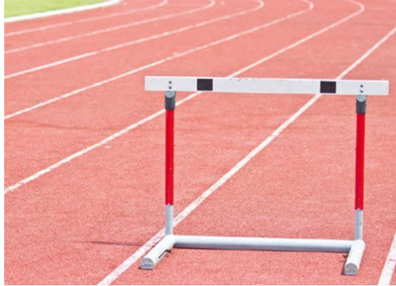
The lack of comparable data has been identified as one of the main challenges for the volunteering sector.

In addition, the existing data is not comparable. Without such data it is impossible to assess the true contribution of volunteer work or to make decisions about how best to encourage and manage it. The lack of comparable data has been identified in the European Commission study on “Volunteering in the EU” 1 as one of the main challenges for the volunteering sector, and raising awareness about the value and importance of volunteering was an objective of the EYV 2011. The lack of comparable data on volunteering was identified as a major challenge in policy documents issued during and after EYV2011 as well as in reports on the implementation of the European Year.