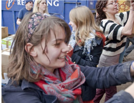
Among young people in Poland, institutionalised support was more popular than informal volunteering.

Data collected during the Volunteer Workforce Module 2011 survey analysed together with the results of Social Cohesion Survey 2011 gathered in the same period drew a detailed picture of volunteering in Poland. The reference period was the four weeks before the interview. During this time, Poles were moderately active in helping others, most often